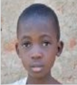
In Kenys, we love to be in school!

the bees only sting if they sense danger, you get in their flying path or they have been ordered by the queen bee. This buzz could become a honey of a blessing.