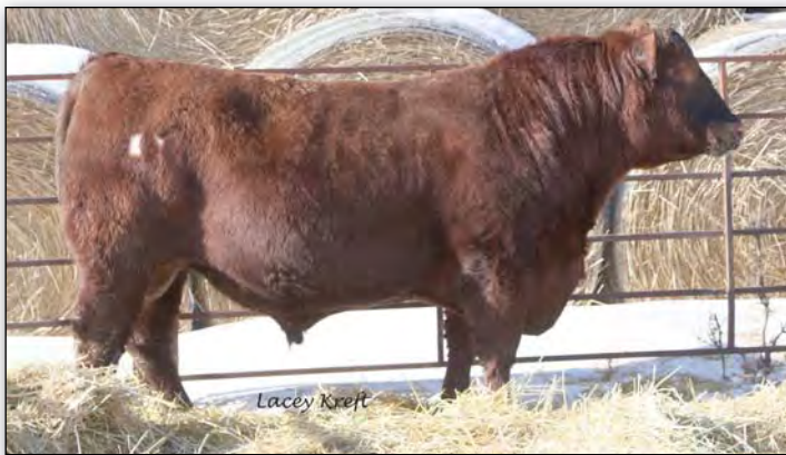
JKW 203 Bravado