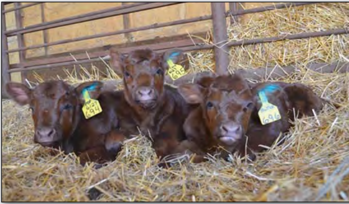
Triplets Pop, Corn and Butter