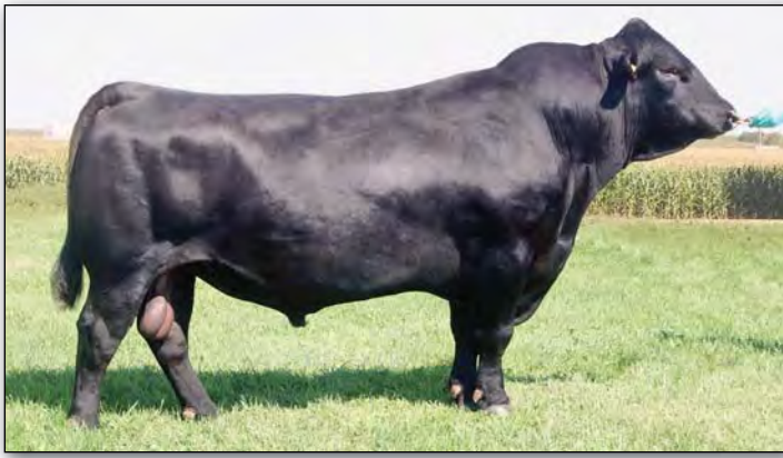
Connealy Impression, sire