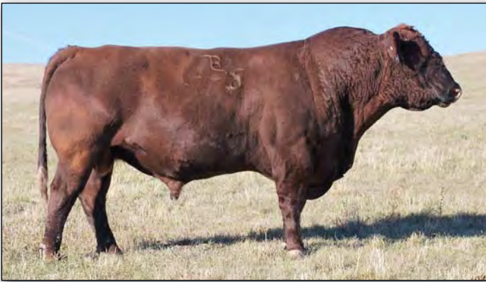
Larson Jubilee 155