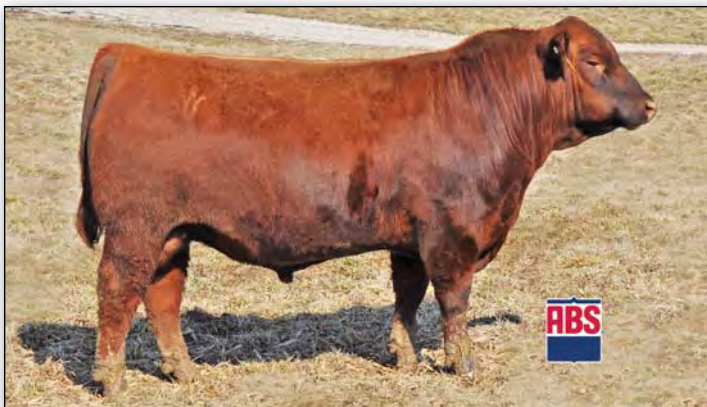
Andras Fusion R236