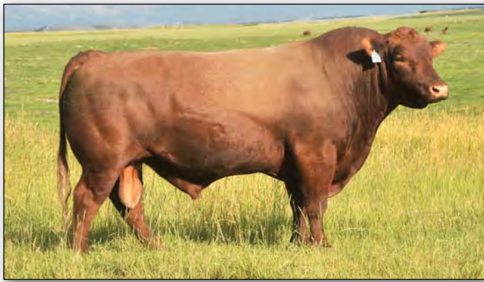
BUF CRK The Right Kind U199