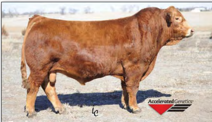
Ellingson Klondike Y123

Ideal is our senior herdsire that has been a never-miss sire for us. His progeny are powerful and they carry his awesome disposition. We have daughters in the herd that are really producing with some of their sons offered in this year's sale.