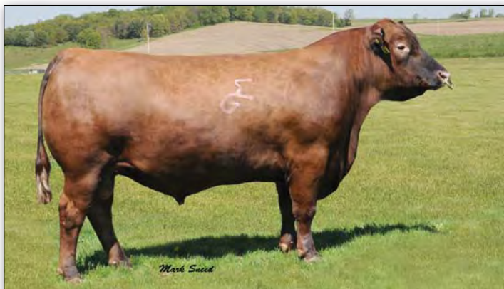
GMRA Trilogy 0226