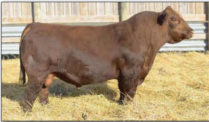
CDI Perspective 238A