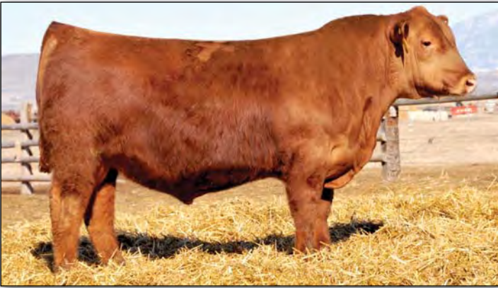
C-T Rio Grand 2044