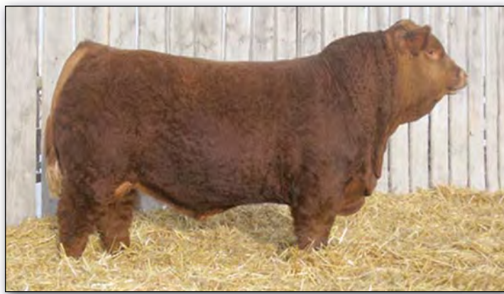
KOP Gladiator 30A