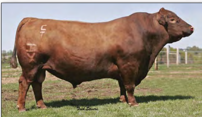
HXC Conquest 4405P

Klondike progeny have as much explosive growth of any bull we have ever used. His daughters are neat uddered with plenty of milk. His sons are long, deep and sure to add pounds. We lost Klondike this last summer to injury but semen is still available.