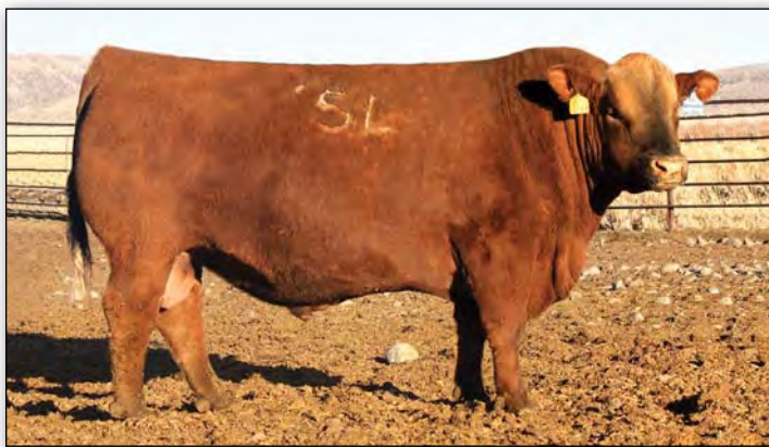
5L Defender 560-30Z