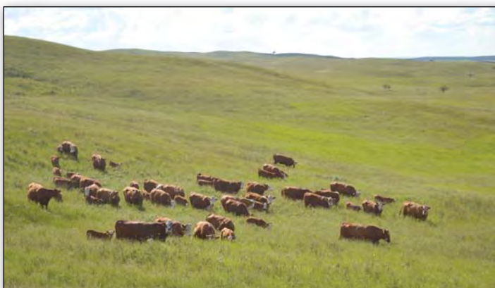
Commercial Cow Paradise