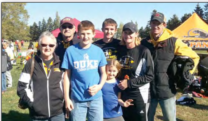
At cross country meet along with Emmy's parents