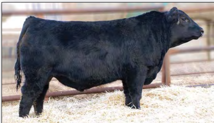
SSS Pay Dirt 357Z