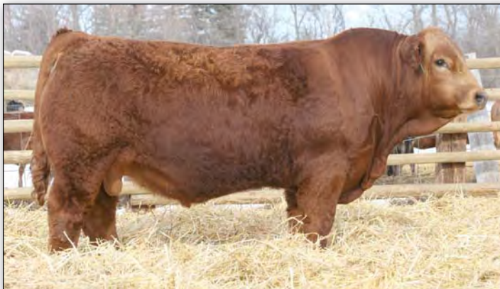
Ellingson Ideal 13X

We bought Perspective to add calving ease and maternal to our program. We are now through our second calf crop using him on our registered heifers and only have assisted one birth. He is a tremendous calving-ease herdsire with above-average growth and is a cherry red color. We feel Perspective is a must-use in any heifer program or to add depth, calving ease and maternal into your cowherd. Semen available through Crosshair Simmental or C Diamond Simmental.