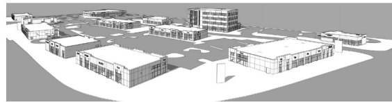
Figure 4: 3D Massing of the site, facing northwest

A Site Plan Control application has been received by the City to develop the lands at 1515 Earl Armstrong Road (northwest corner of Earl Armstrong & Limebank) with a retail shopping plaza for 11 retail buildings, one office building, surface vehicular and bicycle parking and pedestrian connection.