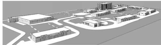
Figure 5: 3D Massing, looking northeast

All related reports to the application are viewable here . Please provide comments directly through the feedback portal accessible through the link by February 14, 2023.