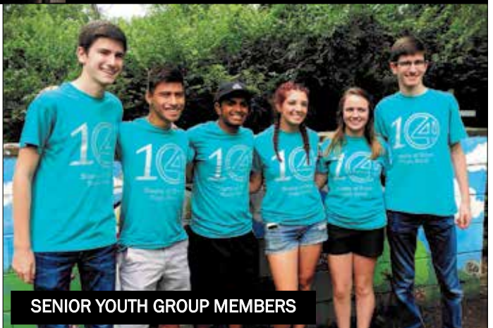
SENIOR YOUTH GROUP MEMBERS