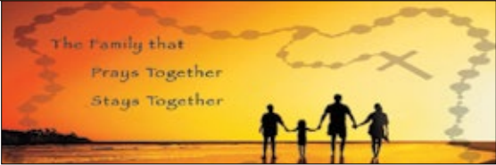
Have a Blessed Summer!! Missionary Sisters of the Holy Family

Family Rosary will resume in the fall when FFP begins...please continue to pray the rosary with your family during the summer.