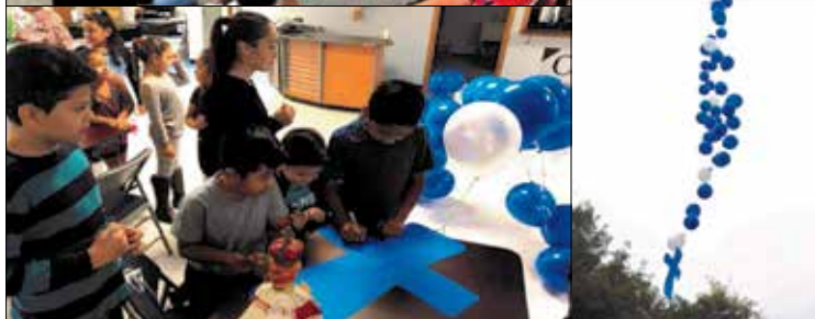
This rosary was made by the children at masses this weekend. The children put prayer requests on the bottom cross and then it was released!!