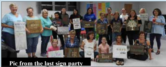
Pic from the last sign party