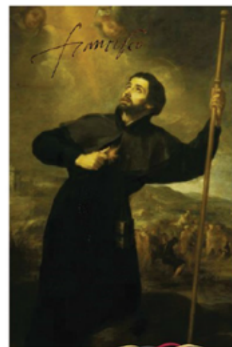
Praying with Saint Francis Xavier The Novena of Grace

God our Father, as St Francis Xavier travelled to the ends of the earth, impelled by love of Christ and afire with his good news, give me the trust and the grace to base all that I do entirely on you, safe in the knowledge that you raise up the lowly and fill them with good things. Through Christ our Lord. Amen.