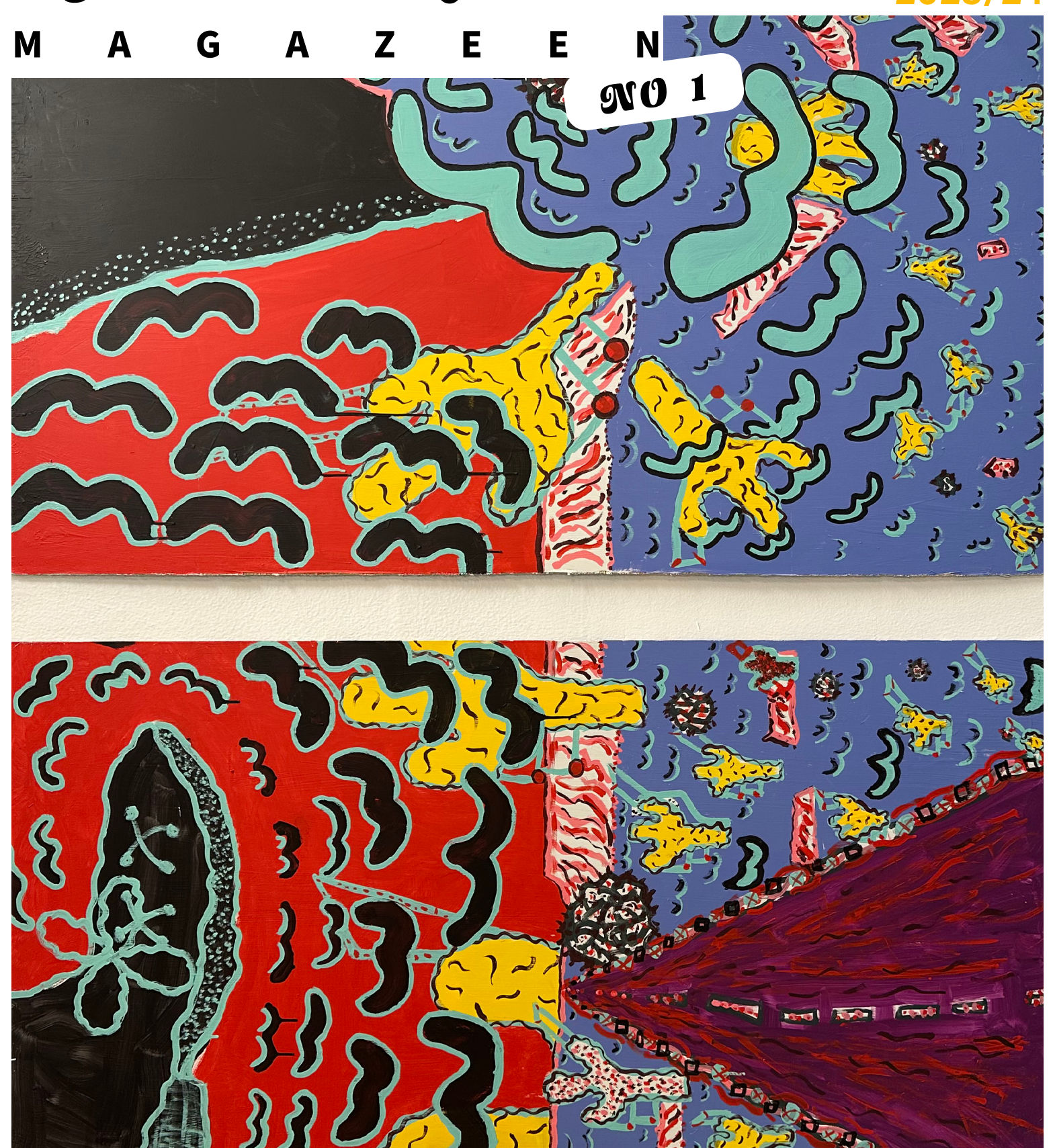
PUBLISHED BY THE COLLECTIVE ART SPACE DEER PARK, TX