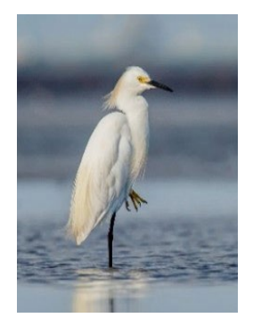
Birds of Chateau Laurie Becker

Snowy egrets are named for their beautiful, all-white feathers which includes distinctive long plumage during the breeding season. Their plumes were once highly sought by