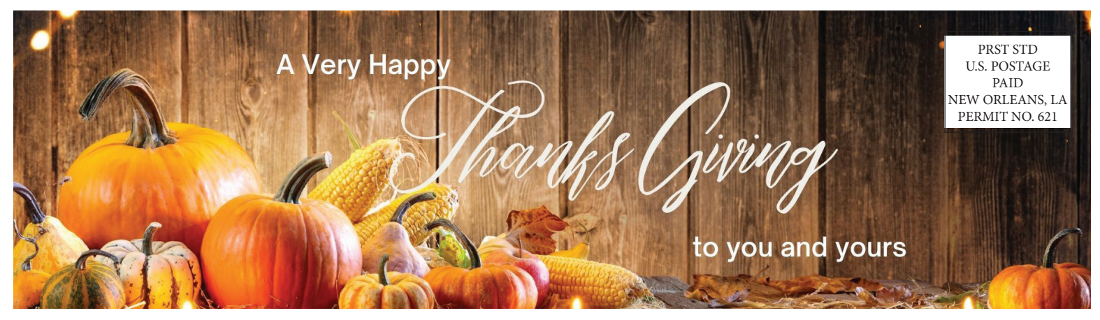
Wishing everyone safe and Happy Holidays From the Chatuea Estates Civic Organization!