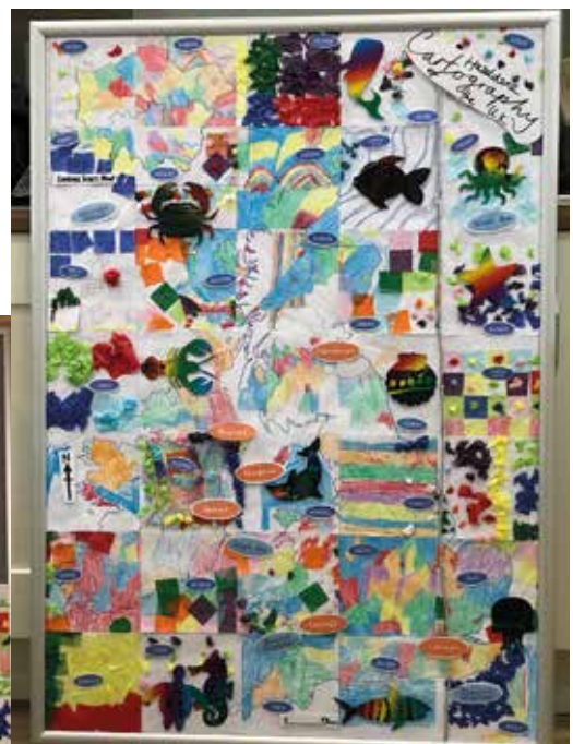
Imagery taken at Hazeldene School, Bedford for their SHINE DAY 2017