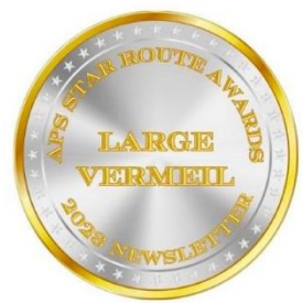
2023 APS Star Route Award

Meetings: 1:00 p.m. 2<sup>nd</sup> & 4<sup>th</sup> Tuesdays Barkley Clubhouse 2605 Barkley Drive West Palm Beach Florida, 33415 cresthavenstamp.club