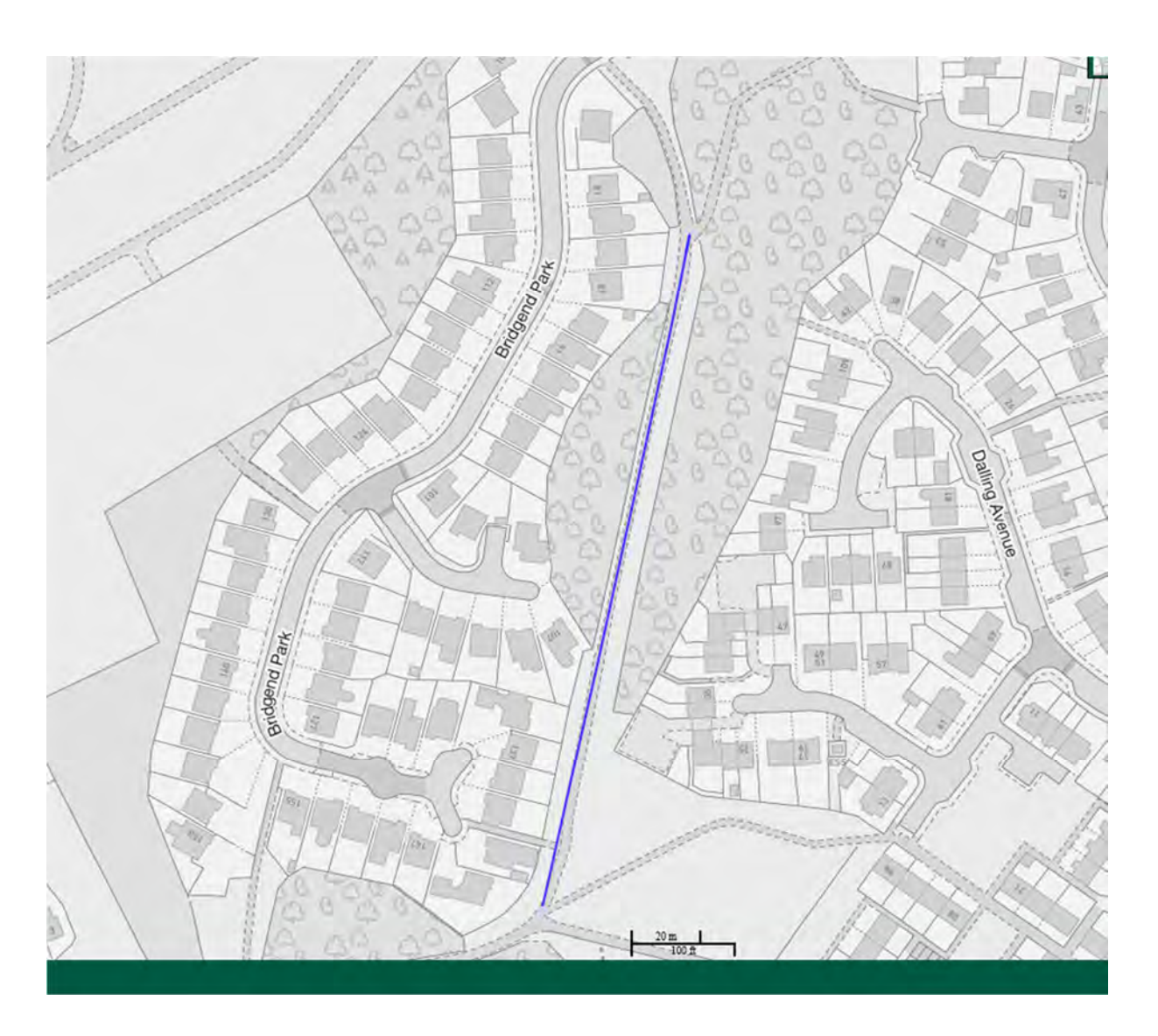
Path 1 - Total Length = 218m