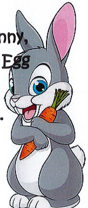
Meet the Easter Bunny