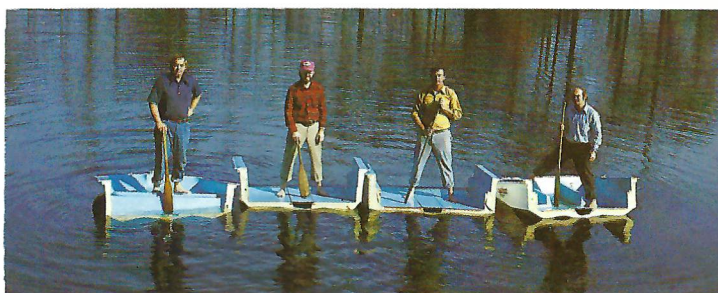
This is an actual 14' McKee craft.