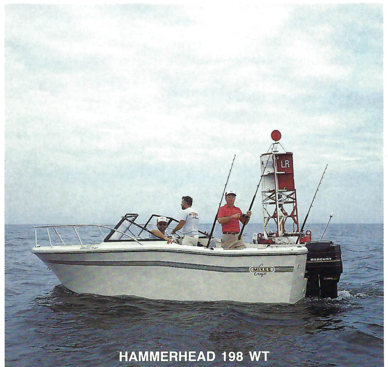
HAMMERHEAD 198 WT