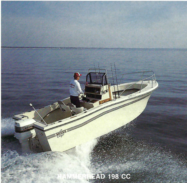
HAMMERHEAD 198 CC