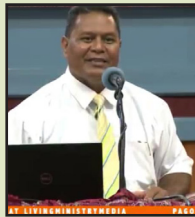
SEAGA KOLAO MOSESE TEUTUPE MATAGALUEGA AMERIKA SAMOA

O lo o faailoa atu i lalo le tulaga o a tatou sefulua'i ma taulaga i le tolu tausaga ua mavae (2016-2018).