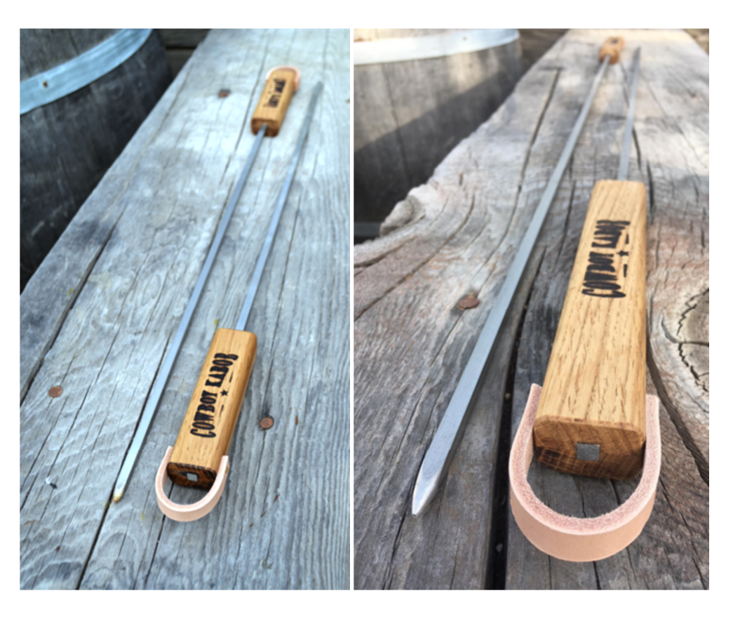
Cowboy Kabob Jr. - 24" Long.