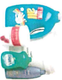
Plastic Containers #1-7