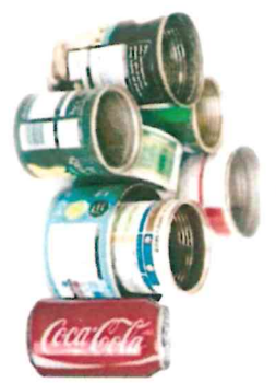
Metal Cans & Containers

The recyclables placed at our transfer station are picked up by the County at no charge. We must adhere to their rules and regulations or the town will be susceptible to fines and revocation of our recycle program. Please see County Brochure posted at attendant's office for answers to your recycling questions. SSR (Single Stream Recycling), not need to sort.