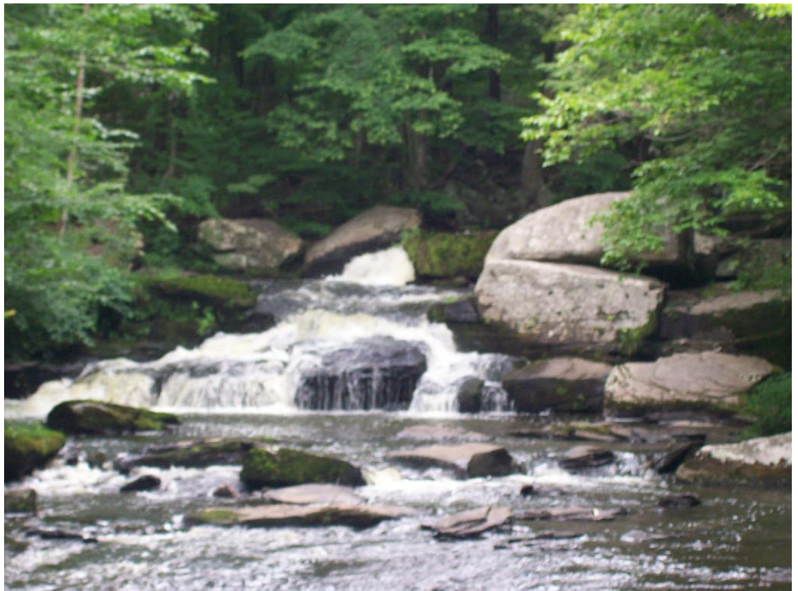
Minnie Falls - Smallwood Memorial Park