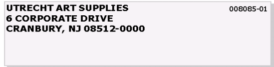
Figure 1 Before