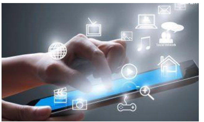
Mobile optimized property website for major announcements, events and other relevant information.