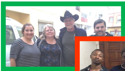
Memories from the past visits to Spain

When we left Mission Bell last Spring we had agreed to return this fall but God had other plans. I was praying about going back to Spain but felt like we wanted to honor the commitment to Mission Bell but also felt torn because our hearts were still to go to Spain.. Shortly after praying, we got a call from Christian Resort Ministries saying they had decided to put us in a different park. Well we had not committed to that park so we felt released to follow the Lord's leading to return to Spain.