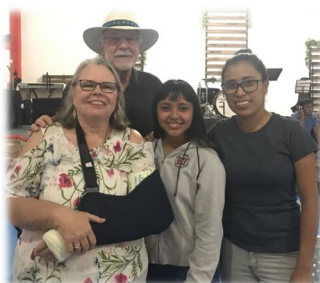
Vale 1 and Vale 2, young ladies who love the Lord