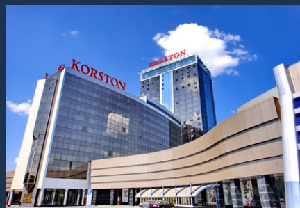
Hotel & Mall Korston, Kazan