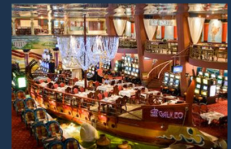
Hotel Korston, Kazan