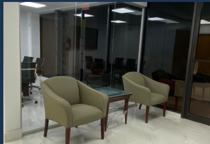
Lancaster Offices, Florida