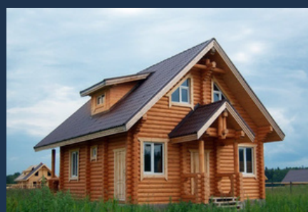
Berezovka Homes, Kaluga