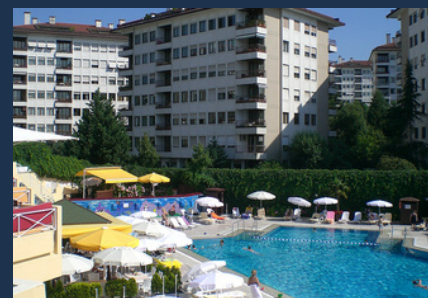
Alkent Residences, Istanbul