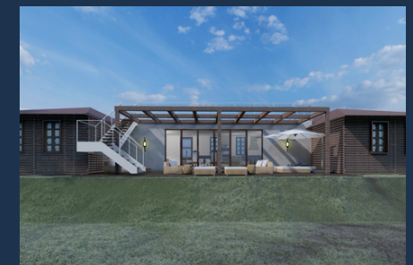
Balaraman Residence Florida