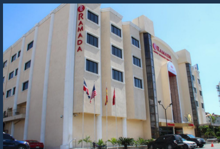
Ramada, Santo Domingo