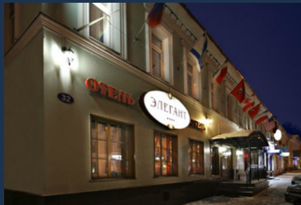
Hotel Elegant, Moscow