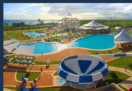
Los Delfines, Santo Domingo