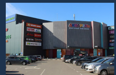
Aquarelle Mall, Moscow