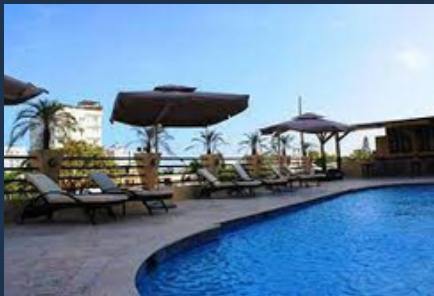
Ramada, Santo Domingo