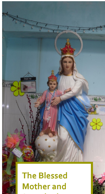
The Blessed Mother and Jesus in the oldest building