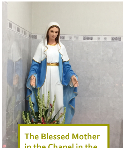
The Blessed Mother in the Chapel in the newest building