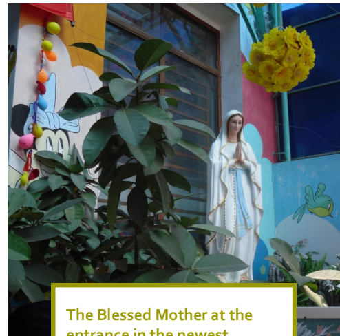
The Blessed Mother at the entrance in the newest building