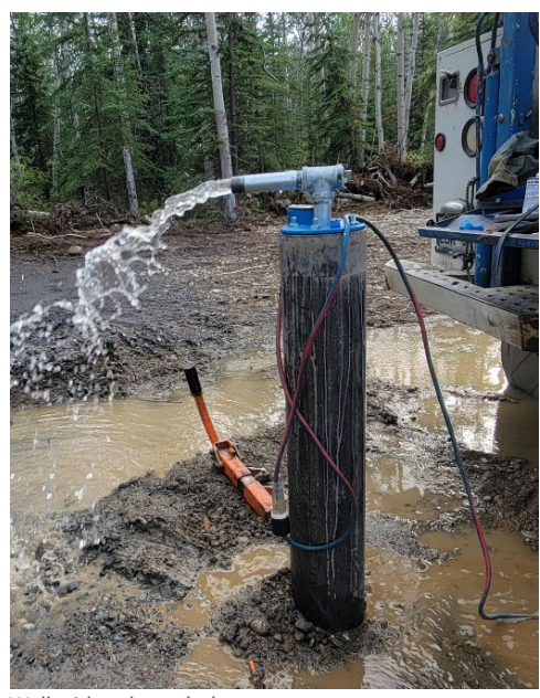
Well with a through the top setup.