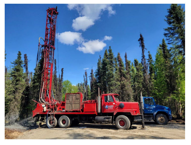
One of our road-access drill rigs with the pip truck behind it. We have two road-access drill rigs and two tracked rig drill rigs.

Clearwater Wells 6830 E. Green Glen Dr. Wasilla, AK 99654 www.clearwaterwells.com