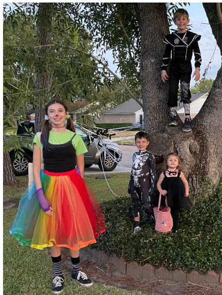
The Pubchara Kids

Kiddos (and kiddos at heart) came together this fall to celebrate Halloween. It's always great fun to see the costumes - some cute, some creative, some confusing! Not to mention, a little friendly neighbor-to-neighbor decorating war can raise the Halloween bar! Here are some photographs from this year's events!