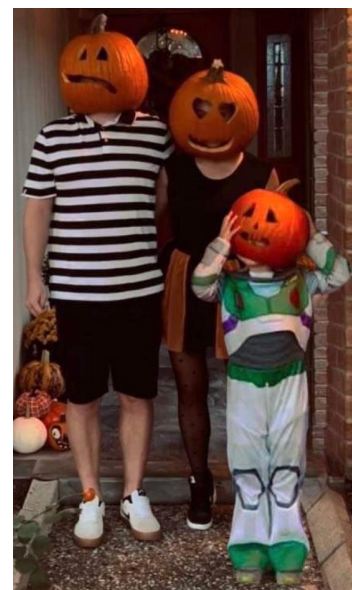
The Driver Family