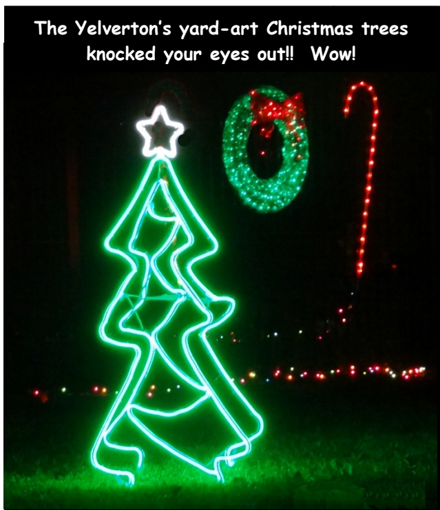
The Velverton's yard-art Christmas trees knocked your eyes out!! Wow!