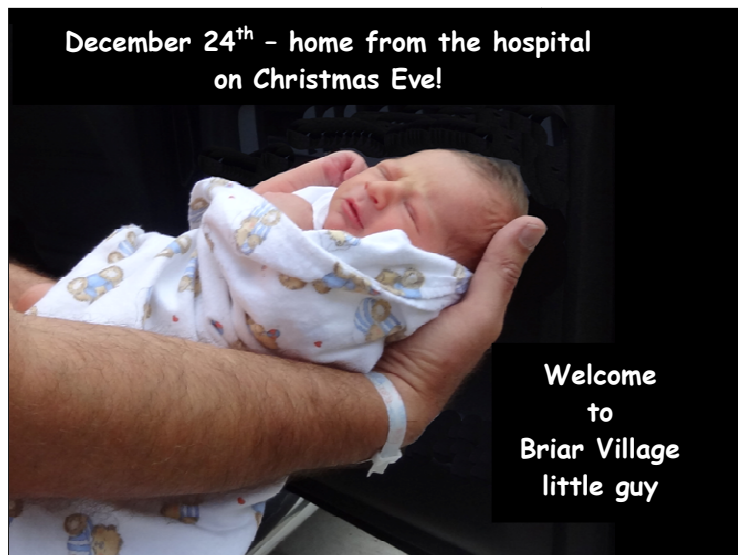
December 24 th - home from the hospital on Christmas Eve!