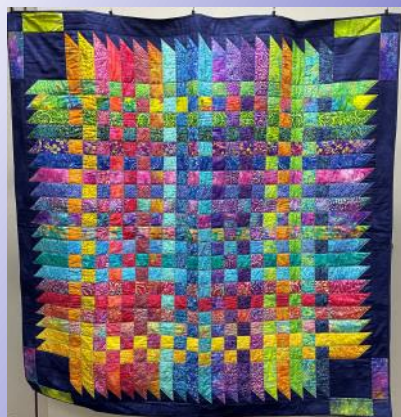
Over and Under