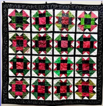
Sister Unity Blocks