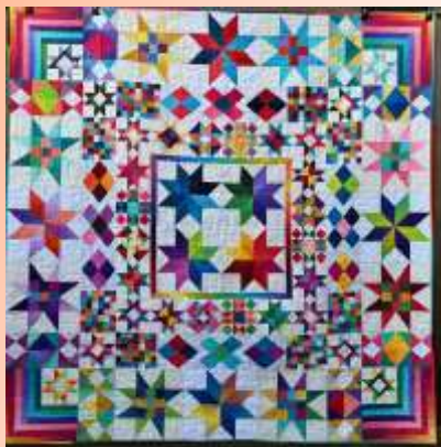
Bakers Dozen Quilt