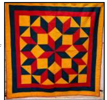
Mennonite Carpenter's Square (76" x 76") c. 1890, artist unknown