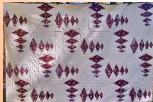
Modern Diamond Quilt

Two quilts for comforters. I made them using the Hanukkah fabrics that were on a giveaway table.