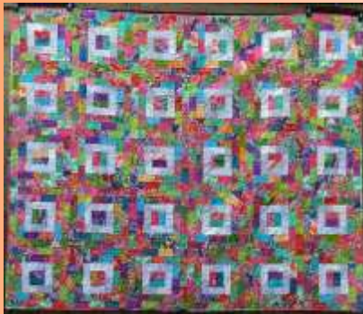
Potato Chips Quilt

This quilt was made with scraps from several Tula Pink fabric lines and some black and white. The blocks are 12 inches finished, made with "chips" that are 2" by 3 1/2". The quilt size is 60" by 72 inches and was quilted on the hoop using an Amelie Scott embroidery design. I am donating it to Comforters.