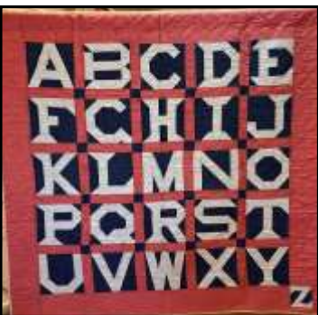
Alphabet Quilt (72" x 76") c. 1870, artist unknown