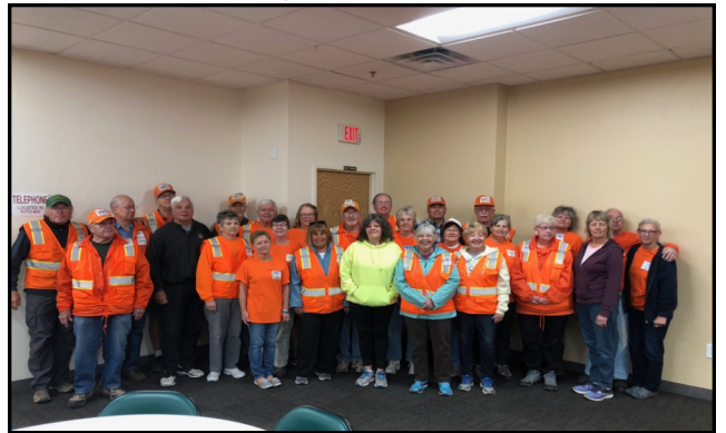
2018 PRIDES Luminaria Workers