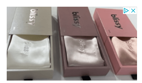
This Pillowcase is Quickly Becoming The Must-Have Gift of 2023

People are obsessed with it. Find out why.