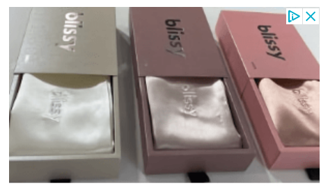
This Pillowcase is Quickly Becoming The Must-Have Gift of 2023

NO COMMENTS ON THIS ITEM PLEASE LOG IN TO COMMENT BY CLICKING HERE (/LOGIN.HTML? REFERER=%2FSTORIES%2FTHE-BRISTOL-MIDDLE-PASSAGE-PORT-MARKER-PROJECT-CHOOSES-LOCATION-FOR-MEMORIAL%2C100050%3F)