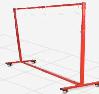
Adjustable Painting Hanger