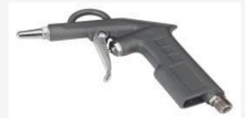
Air blow gun