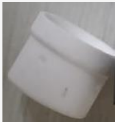
Swirl Ring For Plasma Cutter Torch