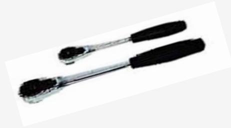
Ratchet, 1/2 drive Ratchet, 3/8 drive