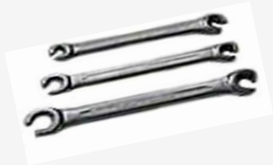
Pipe wrench (Flared Nut) 8-10, 9-11, 12-14mm