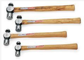
Ball pein Hammer(s)