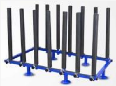
Panel storage rack