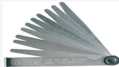
Feeler Blades. Metric/Imperial