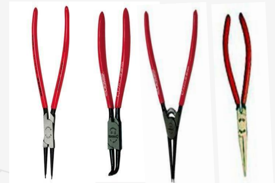
Circlip pliers external/internal