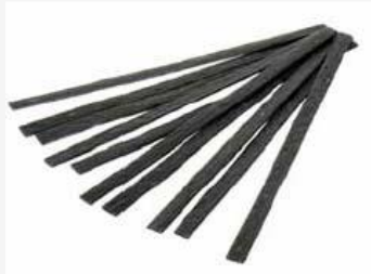
Plastic Welding Rods