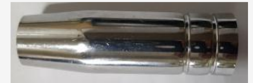
Gas Nozzle 15 AK for Mig 250I