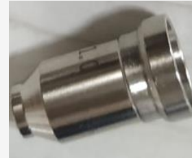
Cut 60 Nozzle For Plasma Cutter Torch