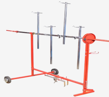
Rotating Paint Stand 360°