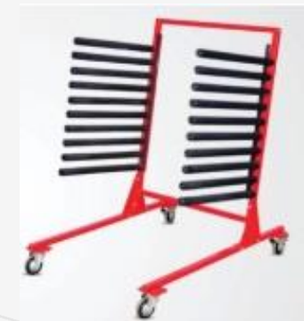
Windshield Glass Rack