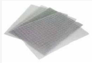
Stainless Steel Wire Mesh