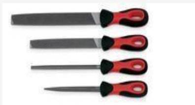
Files, general set