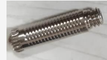
Electrode Cut 60 For Plasma Cutter Torch