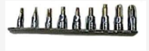
Internal Torx® socket set, 3/8 drive T15 to T55