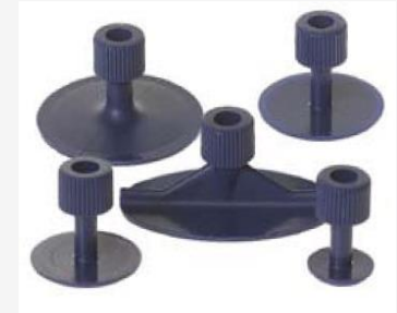
Blue Tips Plastic Set