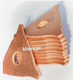
3 Pointed Tips For Sliding Hammer