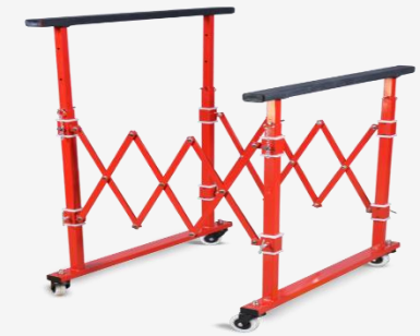
Telescopic Universal Stand Pro