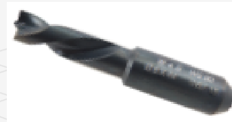
Drill Bit Head 6mm, Total Length 44mm