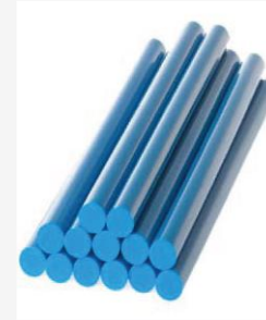
Glue Stick Blue