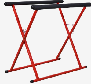
Panel X Stand