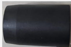
Output Nozzle For Plasma Cutter Torch