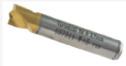
Drill Bit Head 8mm