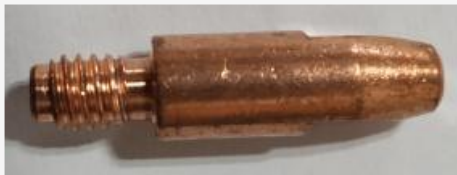
Mig Welder Contact Tip 0.8mm