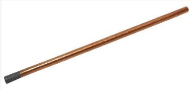
Carbon Electrode 10*300