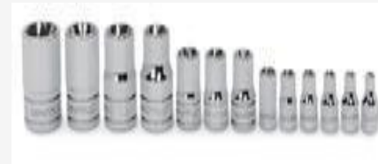
External Torx® socket set, 3/8 drive, E4 to E24