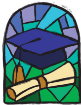
Baccalaureate WORSHIP SERVICE