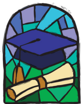
Baccalaureate WORSHIP SERVICE