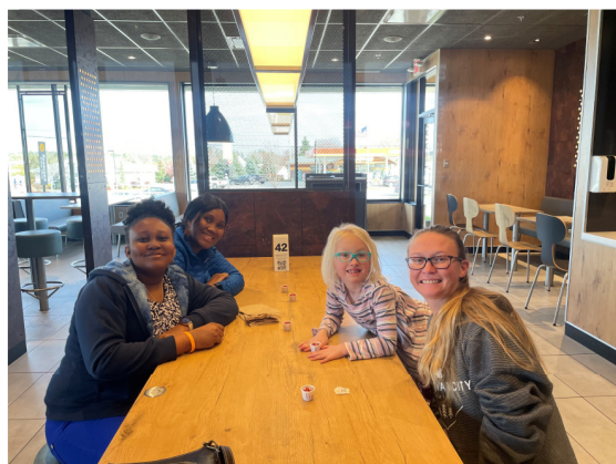
Purchasing Items for Shoe Boxes