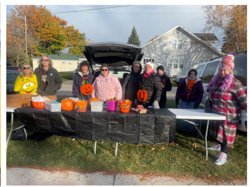
Tree Decorating, Pumpkin Patch, and Trunk or Treat