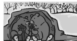
FEBRUARY BIRTHDAYS & ANNIVERSARIES

United Methodist and ECO Presbyterian The Church of the Straits