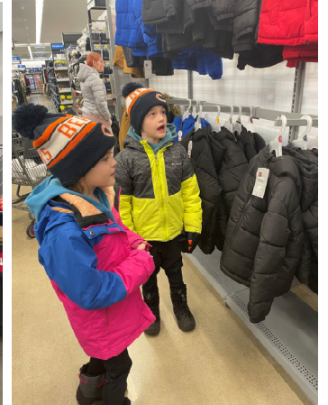
Shopping for Coats for Kids