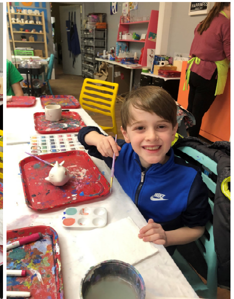
Cheboygan Creation Station