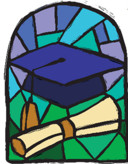
Baccalaureate WORSHIP SERVICE

COS & St. Anthony's will host Baccalaureate for the 2024 Mackinaw City Graduates on Wednesday, May 22nd at 7:00 pm. All are welcome to attend. If you would like to bring a plate of finger food or cookies, a reception will follow the service.