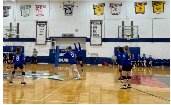
SARM Cheers on Mackinaw City Volleyball Team