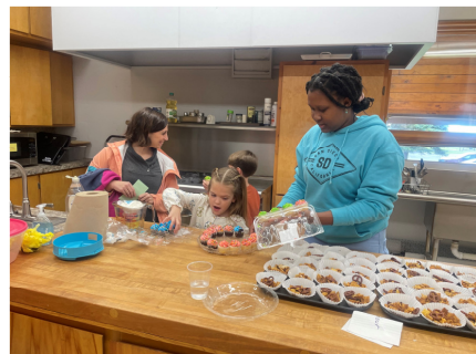
Baby Shower Coffee Hour – Collected Items and Donations for AA Crisis Pregnancy Center