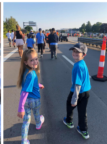
Labor Day Bridge Walk and Breakfast