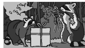
SEPTEMBER BIRTHDAYS & ANNIVERSARIES