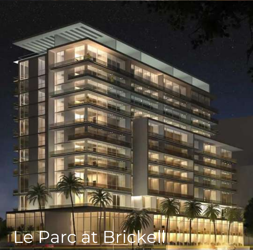
Le Parc at Brickell