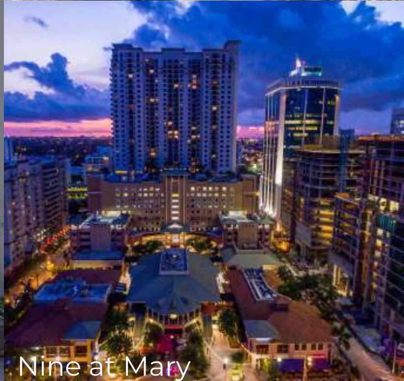
Nine at Mary