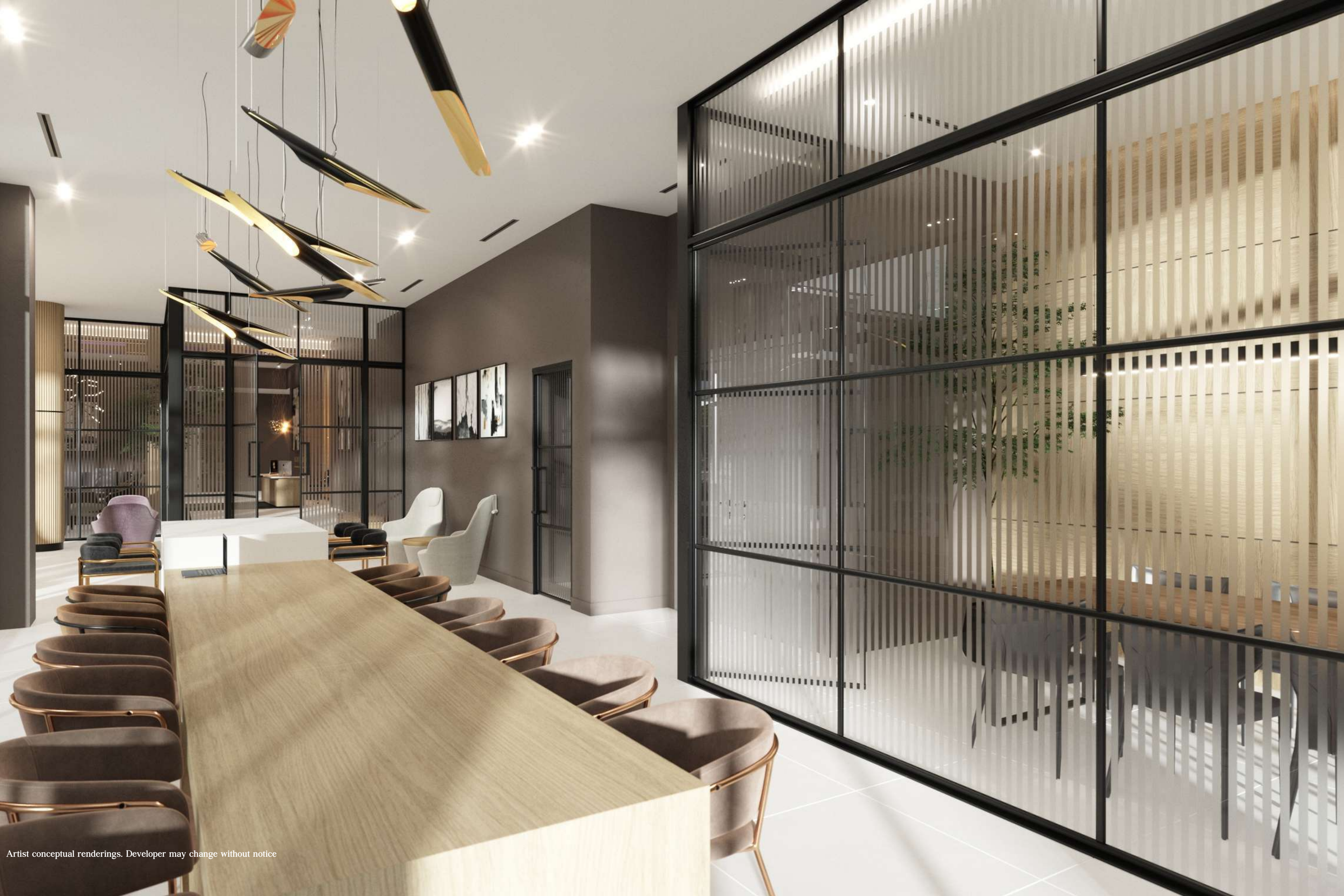
Artist conceptual renderings. Developer may change without notice