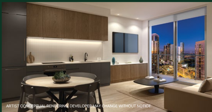
ARTIST CONCEPTUAL RENDERING. DEVELOPER MAY CHANGE WITHOUT NOTICE.