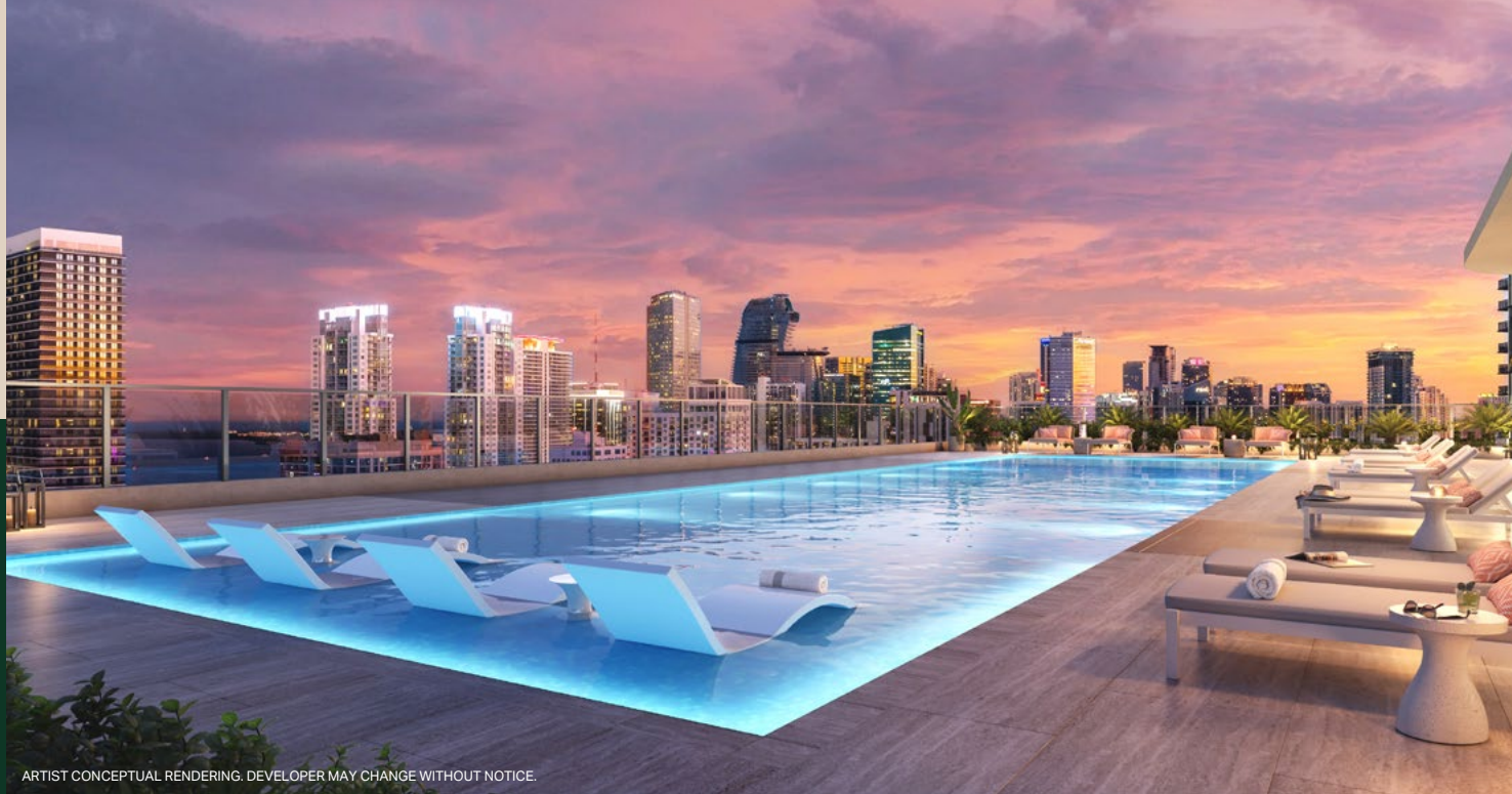
ARTIST CONCEPTUAL RENDERING. DEVELOPER MAY CHANGE WITHOUT NOTICE.