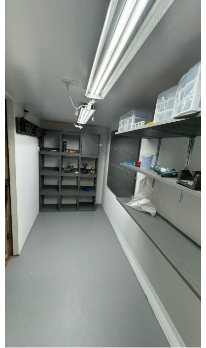
Much more productive use of space. Great job, Guys!