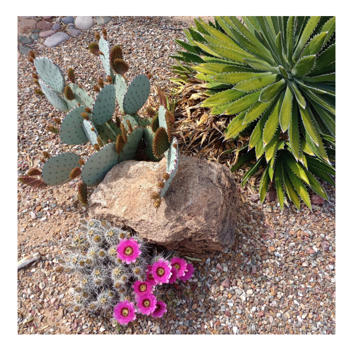
Colors of Villas West