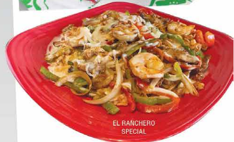
EL RANCHERO SPECIAL