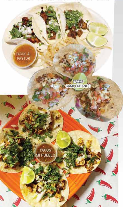
TACOS AL PASTOR

Large flour tortilla stuffed with grilled shrimp and topped with cheese sauce, served with rice and beans. $13.99