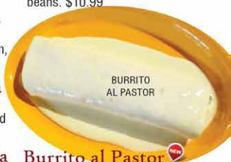
BURRITO AL PASTOR

Two steak & cheese burritos with lettuce. Served with rice and beans. $12.50