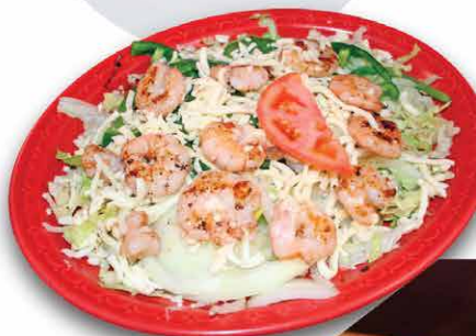
DON JULIO SIGNATURE SALAD WITH SHRIMP