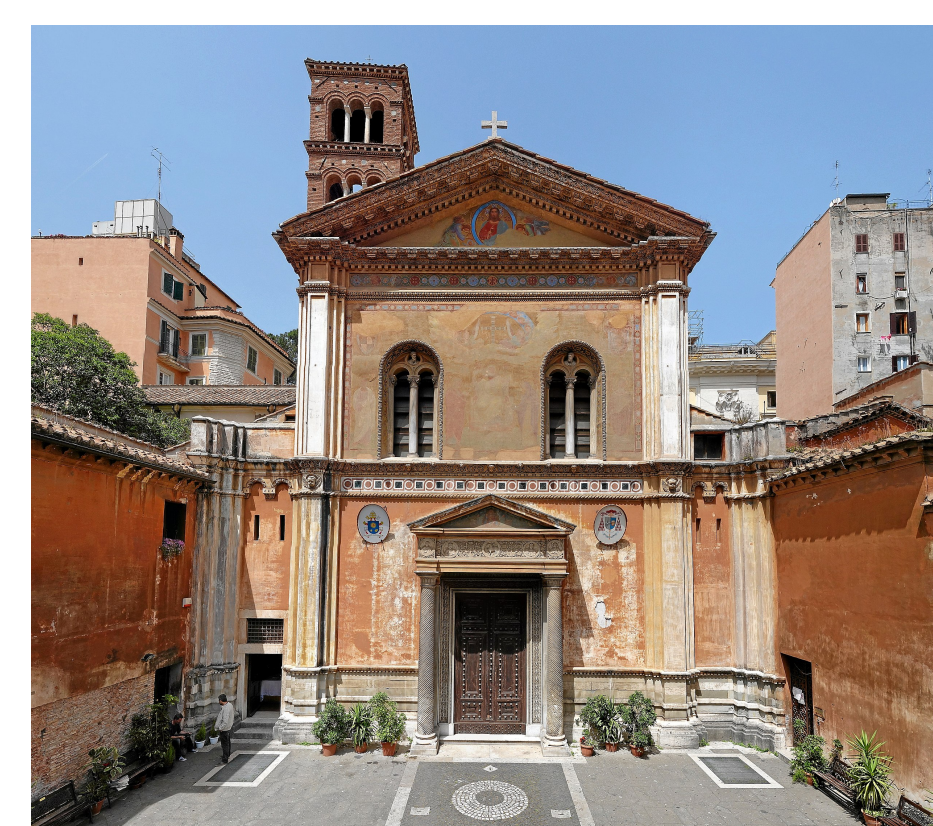
“Basilica di S. Pudenziana” (Rome)