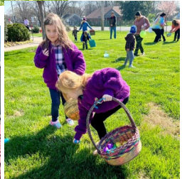
EASTER BLOCK PARTY