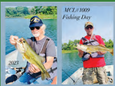
Annual Fishing with MCL McHenry