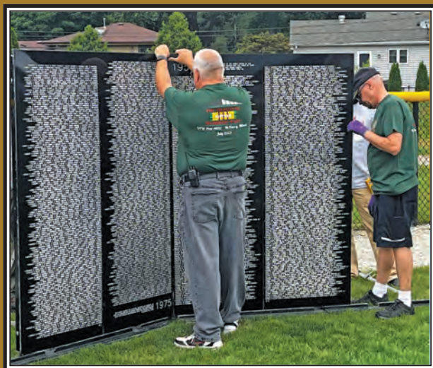
Volunteers assembling wall.