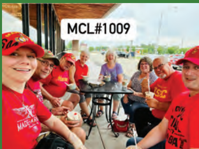
Red Shirt Friday in McHenry

SEND ARTICLES, PHOTO'S, AWARDS AND MORE.